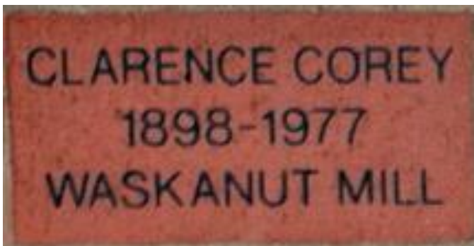
Sample of HELVETICA CAPS All letters are capitalized.