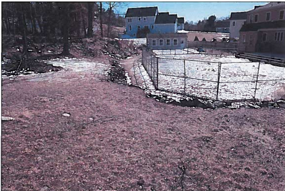
Fig. 5. Alternate photo of cleared Open Space. House on Lot 76 appears to right,