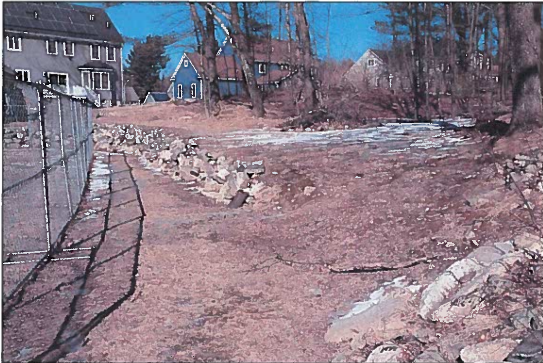
Fig. 2. Lot 76 property line runs down fence shown to left. Open Space lies directly to the right of fence. Note the new stonewall approx. 15-feet right of fence line, as well as cleared area beside fence and to the right. Depth of clearing into the protected Open Space is approx. 60-feet. Also note that grading by owners of Lot 76 slopes from inside the Open Space downward and toward pool area.