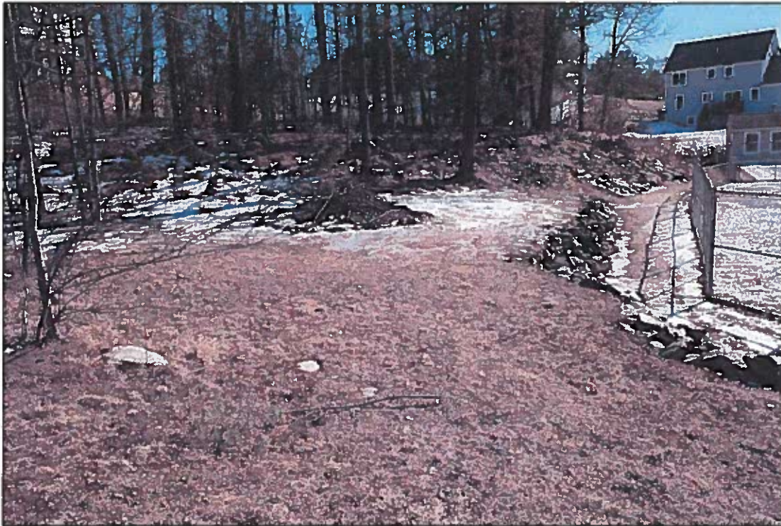
Fig. 4. Alternate view of cleared Open Space (photo taken from Lot 73). Lot 76 lies to right, Open Space to left. The area grassed and graded in left 3/4s of the photo was formerly vegetated; all trees and shrubs were removed and topography graded toward Lot 76 to right.