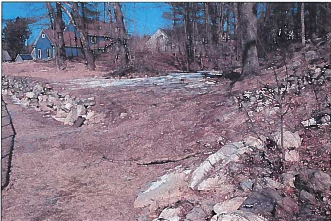
Fig. 3. Second view of Open Space clearing. All of the area with snow was cleared without permission. Note that topography slopes, without exception, right to left toward Lot 76.