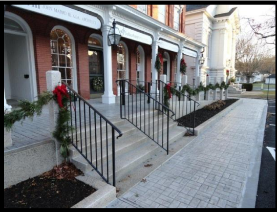
Grafton Town House