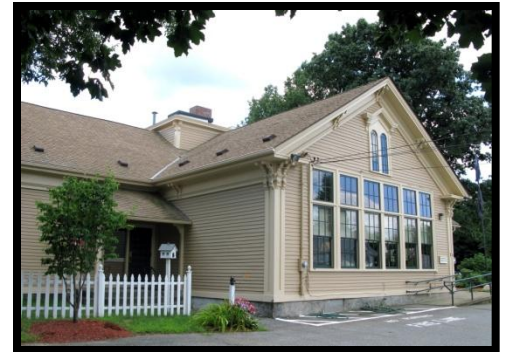
South Grafton Community House