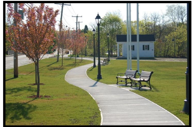
Mill Villages Park